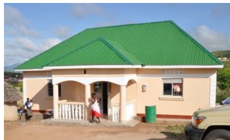
Grace Kolia's house with the view of the Nile

All departed by car around 8 a.m, arriving just before 10 am at Opari, the village where Paride Taban was born. A lot of cars were then already parked, and more were coming. However most of the people came on foot. Police and army were present, instructing in the parking, and monitoring the situation. All were invited in, and the large shed was filled. An altar on a platform was located in front, chairs filling up the rest. The chairs however could take far from all attending, and many were standing on the outskirts of the shed. An estimated number of participants was 3000.