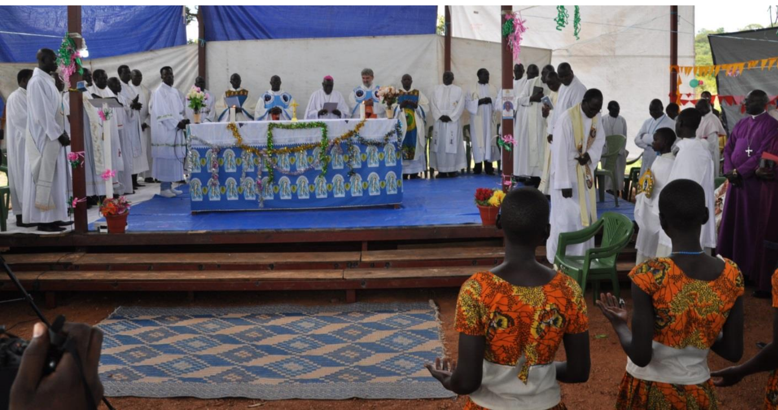
All the religious leaders around the Altar

All departed by car around 8 a.m, arriving just before 10 am at Opari, the village where Paride Taban was born. A lot of cars were then already parked, and more were coming. However most of the people came on foot. Police and army were present, instructing in the parking, and monitoring the situation. All were invited in, and the large shed was filled. An altar on a platform was located in front, chairs filling up the rest. The chairs however could take far from all attending, and many were standing on the outskirts of the shed. An estimated number of participants was 3000.