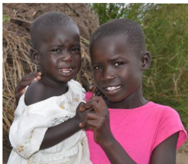
Children at Opari