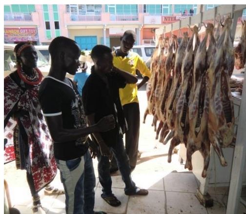
The Toposa group from Kuron checking meat-prices in Konyokonya market, Juba