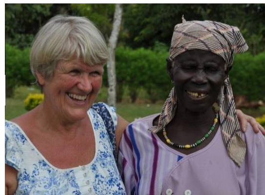
Else met an old friend

All the former staff houses at Arapi were visited, now in use by the Teachers Training Institute.