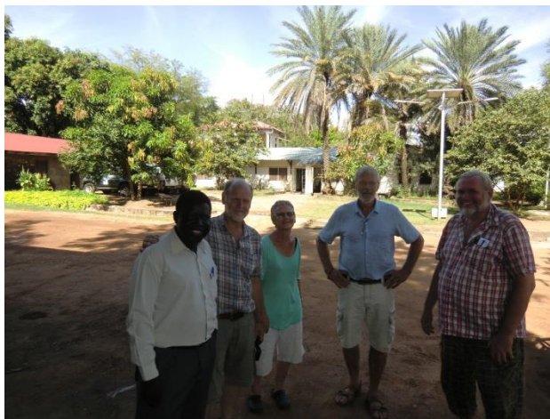
In the NCA compound, Juba

The clinic was in very good condition, well equipped and well organized, now supported from Germany. Eye operations were to start up in 1-2 months,- the only facility with this capacity in all of South Sudan, it was informed.