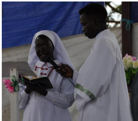
Scenes from The Mass