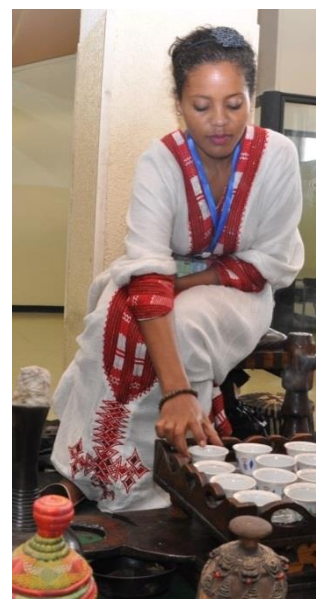
The first meeting with Africa: Ethiopian Coffee at Addis Ababa airport

Luggage arrived for all, and immigration and custom procedures went relatively smoothly. In addition to normal immigration procedures at the airport a relatively new procedure was established: All visitors staying for more than three days have to register and pay a fee at Immigration Office.