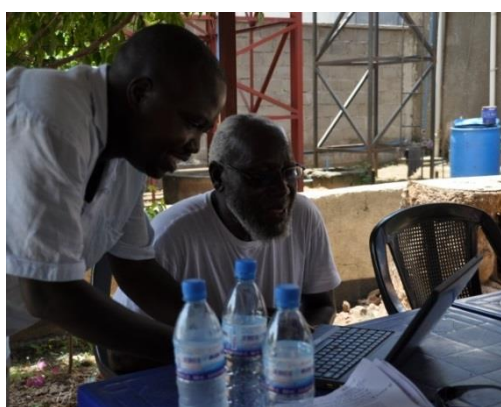
Bishop Paride Taban is preparing his speech for Opari

President Salva Kiir came back from an official visit to Uganda today. At his arrival the main road from the airport was totally closed for traffic until a convoy of some 25 vehicles at high speed, including an escort of some 100 soldiers had passed.