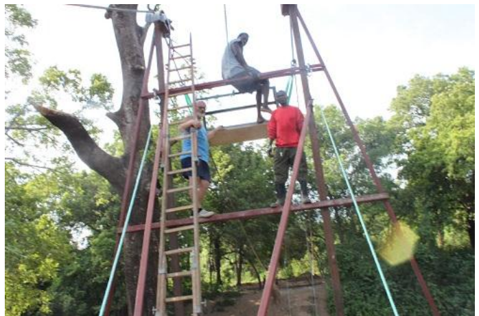
Both Cables ar up!

A really unbelievable work is made possible due to very good professional engineering work by Harald Erland, Norway. The value of that work alone is more than $10000