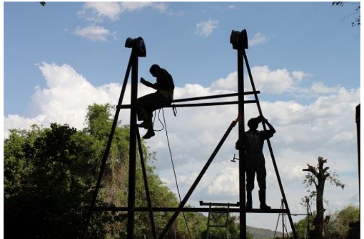
Both stands on both sides are up, Ready for cables