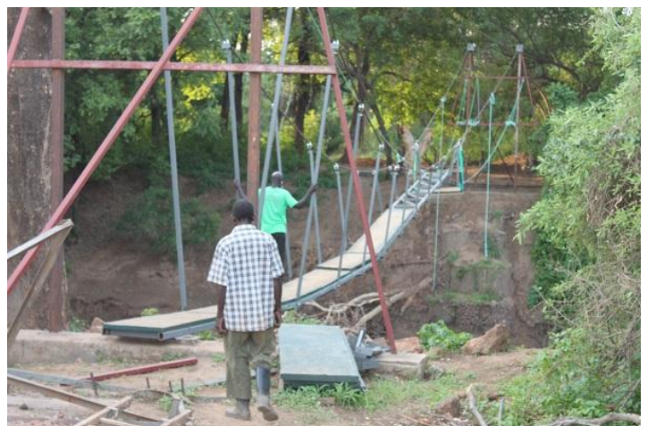
Little by little the bridge takes shape, Fr. Taban trying.