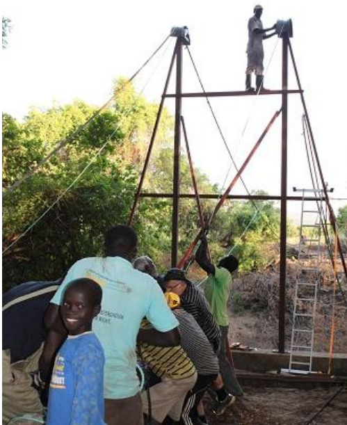
Cabel no 2 has to come NOW! Papa watching at the top, ready to fix the cable to the ½ Rim. Litte by little we managed to realist the vision SAFETY FIRST!