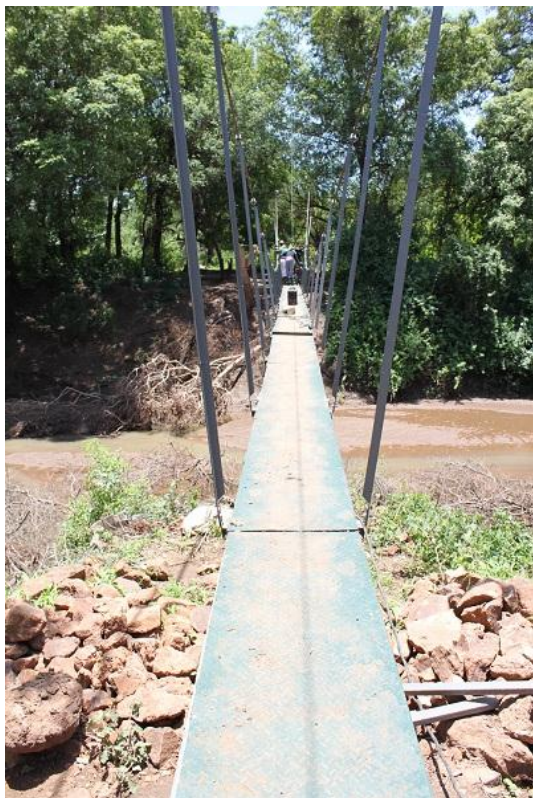
Soon the bridge is walkable