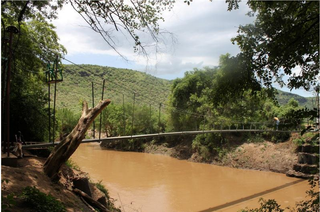
The bridge is still leaching rails; this will be mounted before 15th Mai 2013.

The first suspension bridge in South Sudan