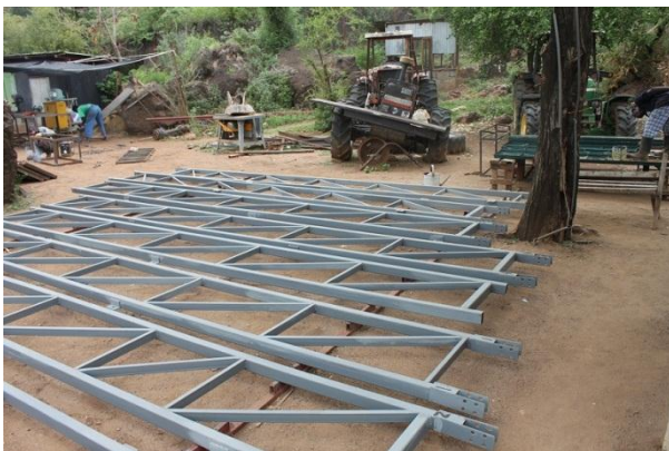
A lot of construction works done at HTPV