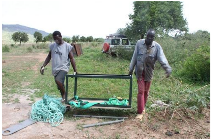
A special Chair has been made supported by special trawler Blocks brought as gift from Fosnavåg Notbøteri in Norway