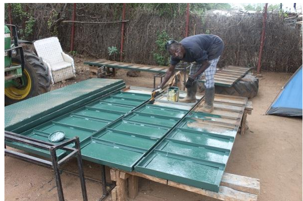
Walkways being painted by Papa