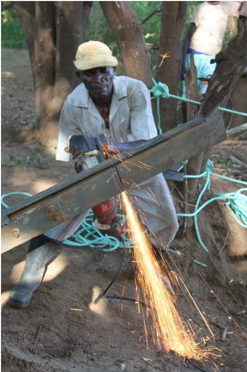
Cutting the anchors to fit exactly !