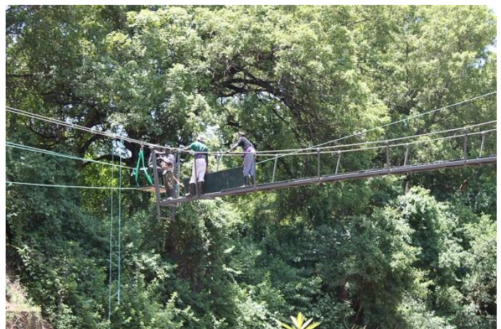
More than half way! An “airy” working place... SAFETY FIRST